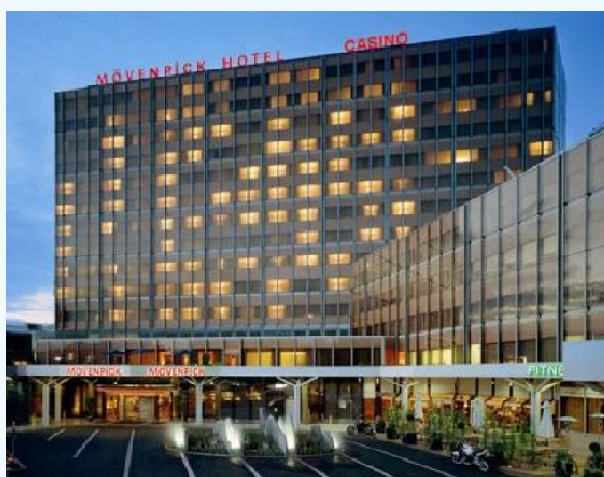
Mövenpick Hotel, Geneva

Check-in time is from 2.00 pm. Check-out time is 12.00 noon. For more information please visit the hotel website.