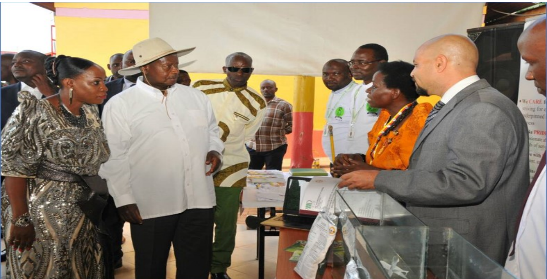
H.E giving leadership during larviciding meeting