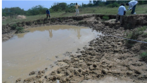
Sand pits and marram pits