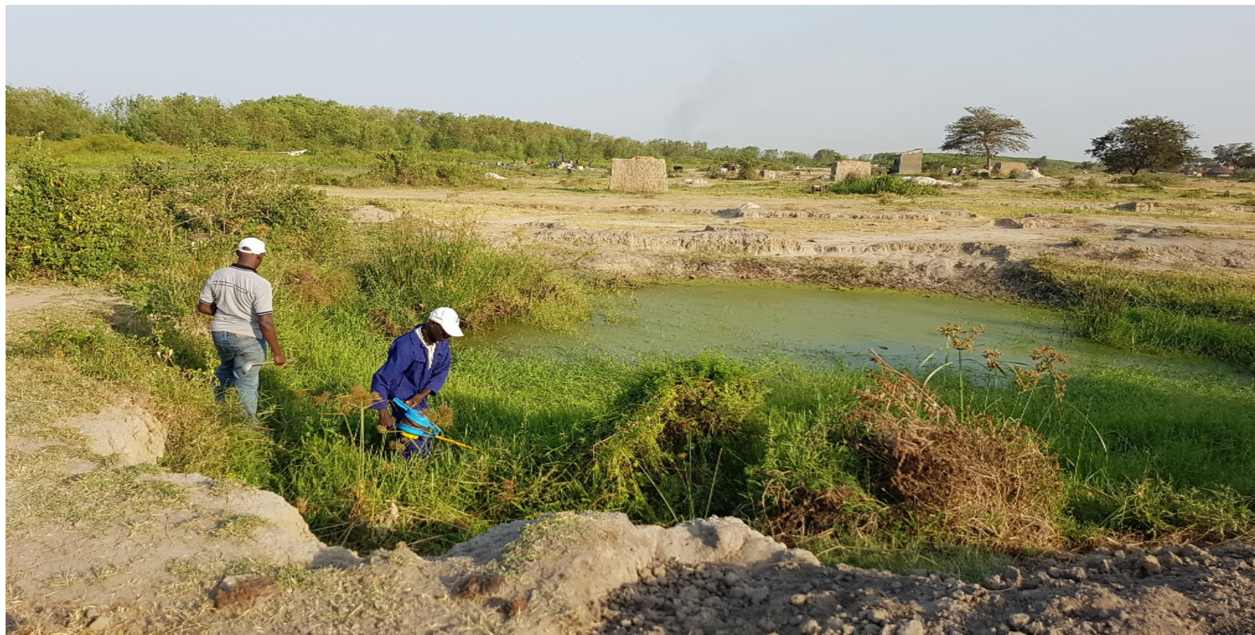
VHT treating a breeding site with larvicide during the large scale study in Nakasongola