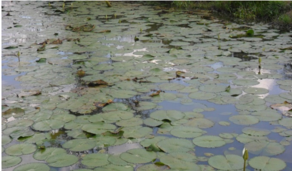
Floating vegetation in artificial dams